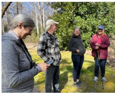
Chatting about Bloodroot