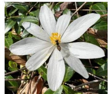
Note Bloom with Calligrapher Bee

Did you know that many of our wildflowers have specialist bees that require their specific pollen to feed their young?