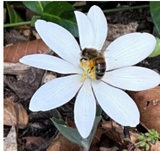
Note Bloom with Honeybee