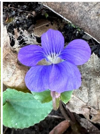
Several species of Violets