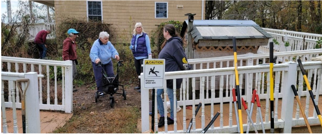
Fall Work-day last November in the Pollinator/Native Plant Garden at Wilna Lodge.

On March 28 and April 6 th from 9:00 am to noon a joint VNPS and NN Master Naturalist project have a garden work day. Bring a pair of garden gloves and your favorite weeding tools and join us at the Wilna Lodge at the Rappahannock River Valley Wildlife Refuge, Warsaw. Two gardens need to be tidied up for spring and can use a few enthusiastic volunteers. Email me at bwash99@verizon.net if you need more information or show up.