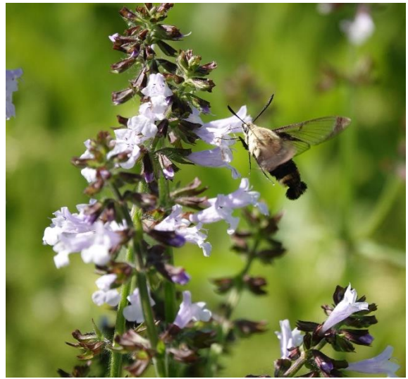
Snowberry Clearwing Moth Nectaring on Lyre-leaf Sage