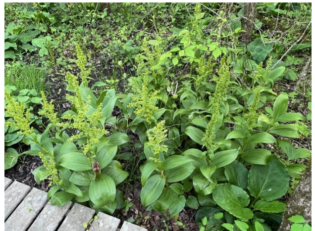
False Green Hellebore – HH hosts the largest colony in the Coastal Plain of the N.A.