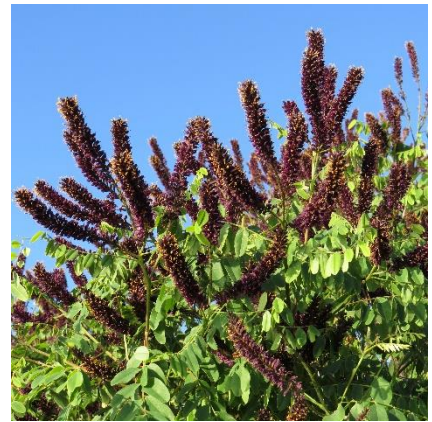
False Indigo-bush, a great shoreline shrub