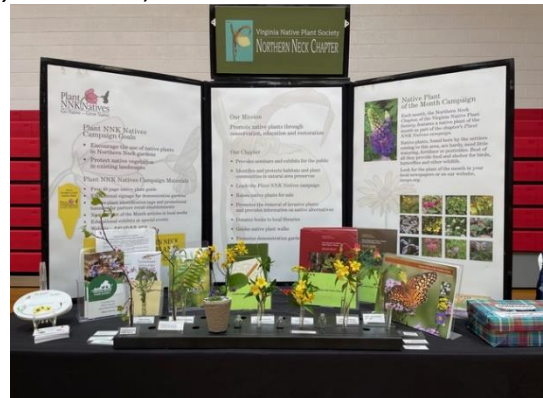
Our lovely display shines with small vials of wildflowers