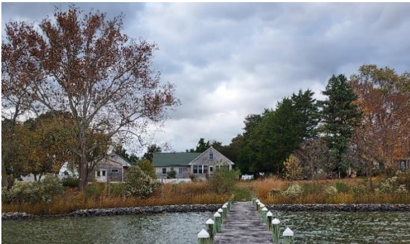
Carol Martin's beautiful shoreline garden in fall

Carol explained that we must protect our shorelines from both the water side and the upland side. Shorelines themselves consist of low marsh, salt meadow, and high marsh or salt panne. Salt grasses are the main plants to use in the low and high marshes, with the additional introduction of salt bushes and salt tolerant perennials in the high marsh. In addition, there needs to be a viable riparian buffer planted above the shoreline with all types of native plants, including deep-rooted grasses, perennials, shrubs, and trees, even if (or maybe especially if) you have a hardened shoreline to protect your shoreline and the Bay from erosion. To learn more or to apply for a Shoreline Evaluation, check out: Shoreline Evaluation Program | Northern Neck Master Gardeners (nmg.org) or VIMS Field Guide to Virginia's Marsh Plants.