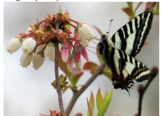
Zebra Swallowtail on Highbush Blueberries

Asters and Goldenrods top the list of the best herbaceous perennials by supporting over 100 species of butterflies and caterpillars and 33 species of specialist bees. While Milkweeds don't top the list, they are a 'poster child' as a host for the endangered specialist Monarch butterfly. The blueberries in the genus Vaccinium support over 100 species of butterflies and moths (baby bird food!) and 33 species of specialist bees. Plant some of these high wildlife value species this spring!