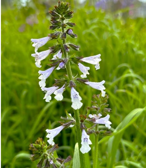
Lavender blue tubular flowers in whorls

This beautiful plant is highly adaptable, growing in full sun to partial shade and in dry soils or those that are occasionally wet. It even tolerates mowing and foot traffic and can be used as a lawn alternative. During late April and May this beautiful wildflower can be seen growing in extravagant abundance in fields and along our roadsides creating a lovely sea of soft -lavender blue blooms. This is a testament to the sheer adaptability and rugged nature of this native wildflower. Its tubular flowers attract a variety of long-tongued bees, hummingbirds and hummingbird moths to its nectar and is deer and rabbit resistant as well. Read more at www.nnvnps.org