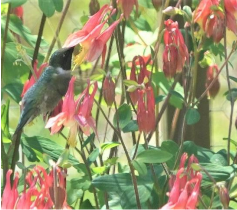
Wild Columbine & Hummer

What's Blooming Around the Neck and in the next few weeks? Here's a few faves!