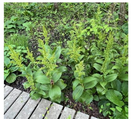
American False Hellebore