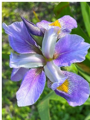
Blue Flag Iris