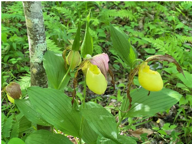
The globally rare Kentucky Lady Slipper Orchids In Cabin Swamp at Hickory Hollow

May 16 th Meeting – field trip to Hickory Hollow Natural Area Preserve – meet in parking lot by 1:00 pm. Wear sturdy walking shoes and dress for the field with insect repellent, etc. Much of the walk will be on level ground on the White trail but the path down to Cabin Swamp is somewhat steep and narrow. A preview of some of the fabulous plants that should be blooming and flaunting their glory include the rare Kentucky Lady Slipper Orchid, Purple Twayblade, Green False Hellebore, Solomon's Seal, Wild Ginger, statuesque swamp ferns like Cinnamon, Royal ferns that can reach up to 4 or 5' tall in rich moist soils, as well as the diminutive Grape and Adder's Tongue ferns.