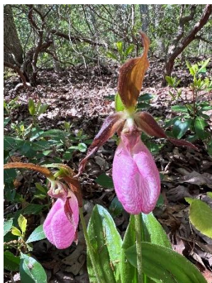
Pink Lady Slipper