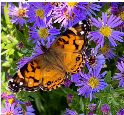
American Lady on Aster

What can you do to promote Biodiversity on your own property? Shrink your lawn, Plant native species such as Oaks, native cherry, willows, or birches or herbaceous perennials such as asters, goldenrods or sunflowers that support hundreds of species of wildlife; Plant for specialist pollinators that are often dependent on a single genus or species of plant – like the Monarchs and milkweed, Plant generously and in layers – plant a dogwood or serviceberry under your Oak and surround this with shrubs and an herbaceous groundcover as a “living mulch”. Refer to our guide, Native Plants for the Northern Neck for more beautiful and ecologically rich plant choices.