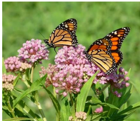
Monarchs nectaring on Swamp Milkweed