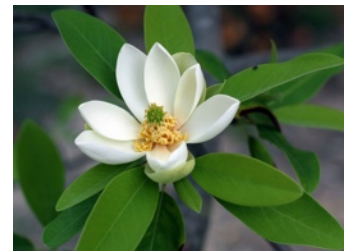
Go Native Grow Native Plant of the Month for March 2013 Magnolia virginiana