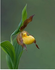
Cypripedium calceolus Yellow Lady's Slipper