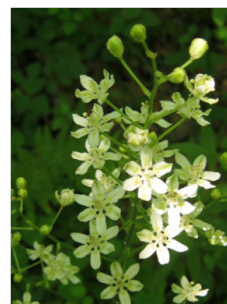
Veratrum virginicum Virginia Bunchflower