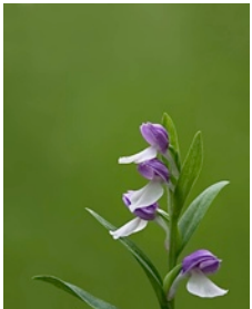
Galearia spectabilis , showy orchid

Her talk was very informative from several standpoints. She showed us what equipment she took into the field to do her photography; a make up brush to dust off dirt from the plants she wanted to photograph, clips to hold back plant material that would normally interfere with focusing on the particular flower she wanted to capture, and protective clothing allowing her to lay in the ground for a long time waiting for the sun to hit the plant at just the right spot. She had a full bag of tricks, most of which she improvised and were not costly.