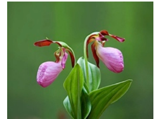
Cypripedium acaule , Pink Lady's Slipper