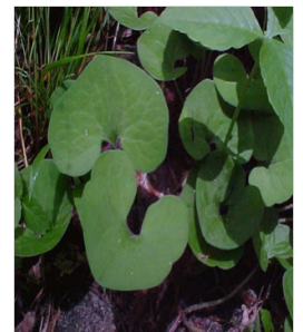
Asarum canadense Canadian Ginger