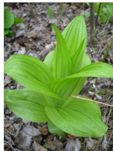
Veratrum viride False Hellebore

Actaea pachypoda Doll's Eyes Adiantum pedatum Maidenhair Fern Aralia nudicaulis Wild Sarsaparilla Asarum canadense Canadian Ginger Homalosorus pycnocarpon Glade Fern Caltha palustris Marsh Marigold Cornus alternifolia Alternate-Leaf Dogwood Cypripedium kentuckiense Kentucky Yellow Lady's Slipper Hexalectris spicata Spiked Crested Coralroot Magnolia tripetala Umbrella Magnolia Stewartia ovata Mountain Camellia Veratrum virginicum Virginia Bunchflower Veratrum viride False Hellebore Viola labradorica Dog or Alpine Violet